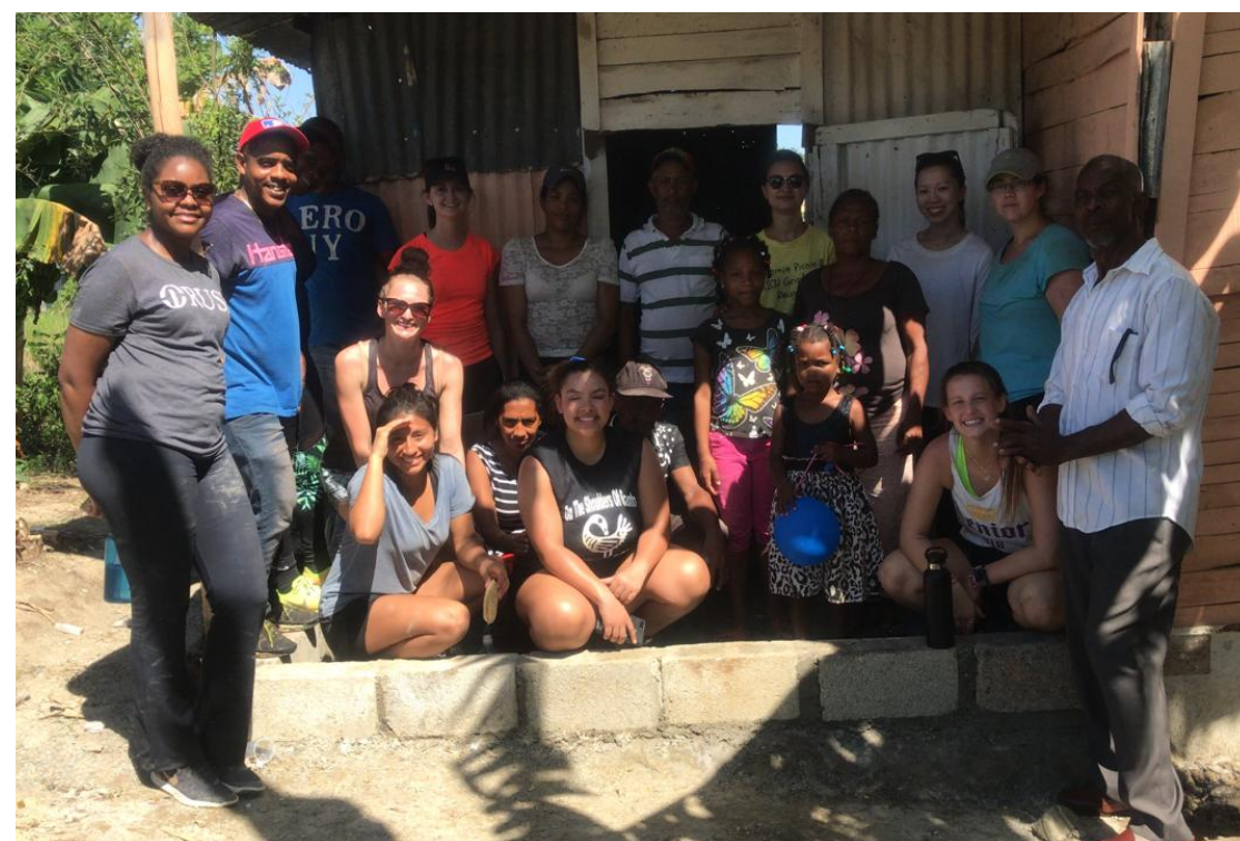
Nolia, a widow, currently lives alone with a granddaughter.